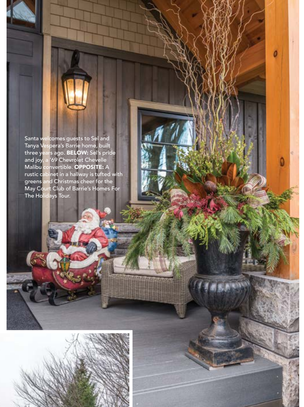
Santa welcomes guests to Sel and Tanya Vespera's Barrie home, built three years ago. BELOW: Sel's pride and joy, a '69 Chevrolet Chevelle Malibu convertible. OPPOSITE: A rustic cabinet in a hallway is tufted with greens and Christmas cheer for the May Court Club of Barrie's Homes For The Holidays Tour.

Foraged wild mushrooms shared under a wood-beam ceiling may conjure up images of off-the-gridders in a country cabin, but the appeal of forest harvesting and natural building materials has also found its way to the well-appointed suburban kitchens of health-conscious families.