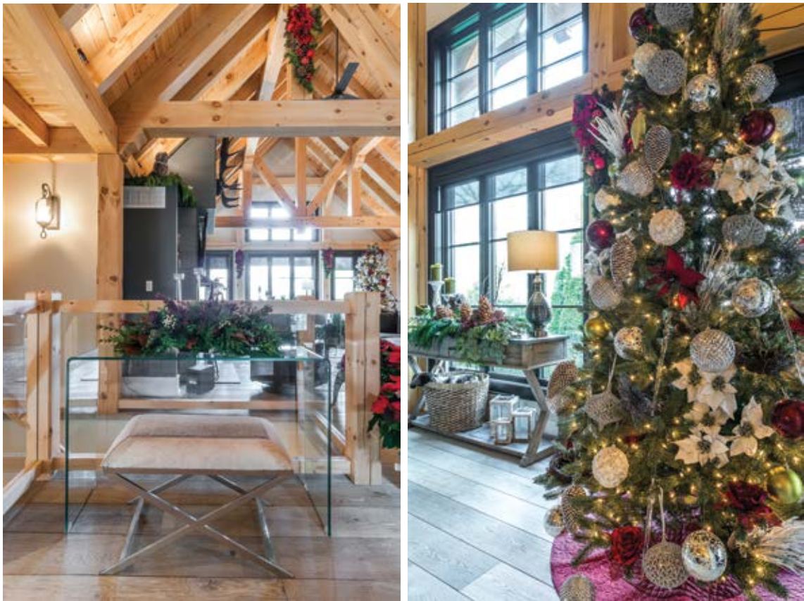
RIGHT: Glass railings surround the staircase leading to the lower level. A glass table and bench fit nicely in the space. FAR RIGHT: Barrie's Garden Centre provided all the flowers and greens for the home. BELOW: The great room is where the family gathers to enjoy the fire and the big screen television.