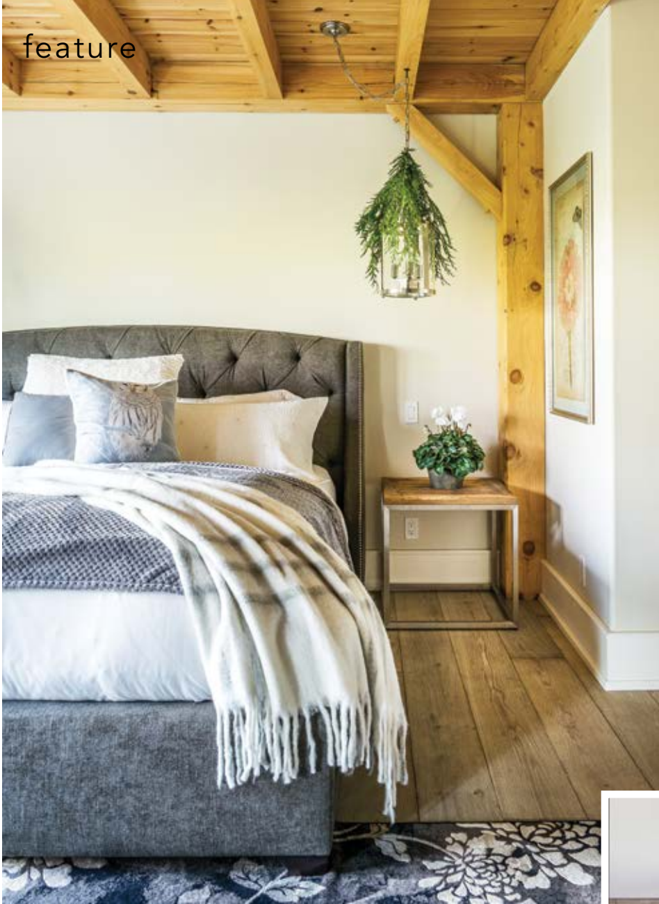
A heavy throw is like icing on this bed with its tufted upholstered headboard. RIGHT: The en suite's walk-in shower has a pebble stone floor. FAR RIGHT: A vessel tub is surrounded by floor-to-ceiling tile.